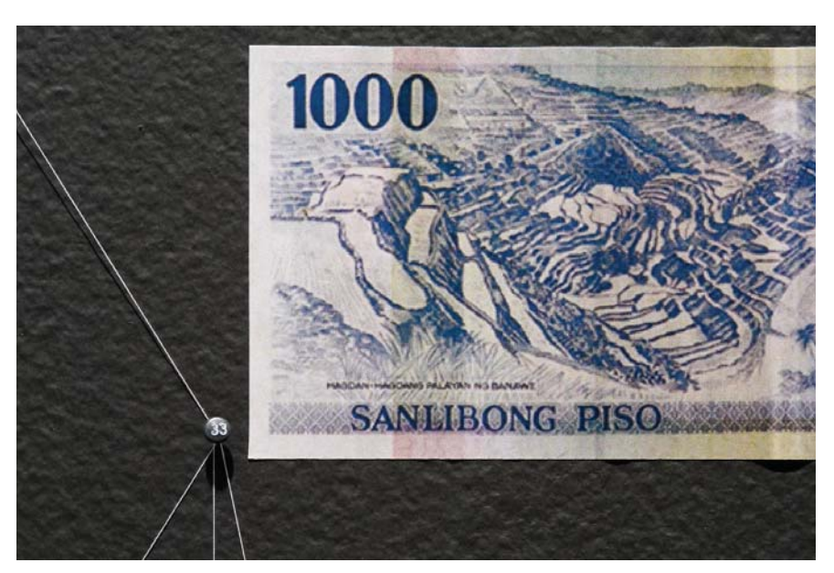
Reproduction of the Philippine 1,000 Peso bill included in Considering Rice.

180-degree panorama depicting one of the amphitheater-like terraces at Ifugao. This constellation of photographs are sculpted like the terraces themselves. Cinematically, during a pan, the camera slowly turns its head creating an impression of seamlessness. When exported as individual stills and layered in a three-dimensional arrangement, these images become fragmented. Details duplicate, time concretizes, individuals, vegetation, and architectural structures reappear in multiple stills. The detail and fragment are key to Gan's installation, interfering with the totalizing gaze of