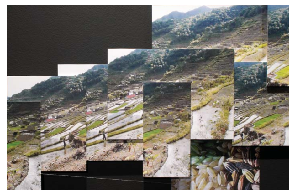
Considering Rice, mixed media installation, dimensions variable, 2010 (detail).